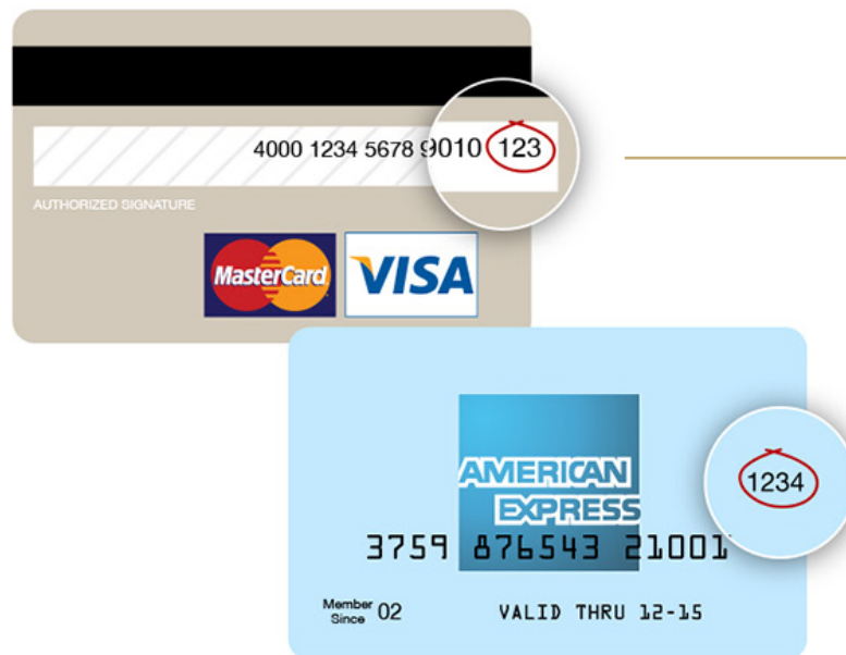
CCV location on Mastercard, Visa & American Express cards

Visa, Visa Electron, MasterCard, Maestro card, and American Express Card are accepted.